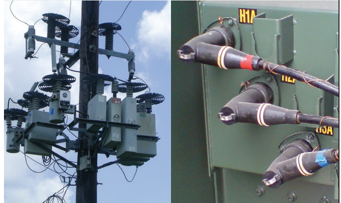
Typical distribution transformers where maintenance and monitoring are critical

Equipment described herein is subject to US export regulations and may require a license prior to export. Diversion contrary to US law is prohibited. ©2018 FLIR Systems, Inc. All rights reserved. 11/02/18 – 18-1610-INS